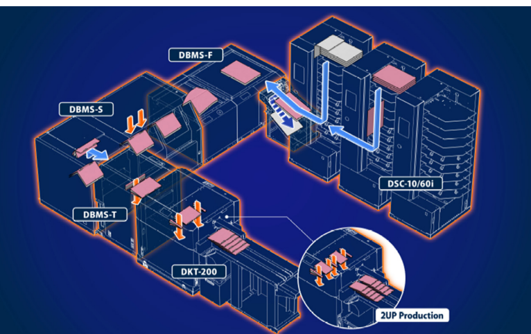
iSaddle 2 paper path

The high speed and intelligent DSC-10/60i suction towers deliver superior performance whilst maintaining complete accuracy. Each tower of 10 bins comes with A.M.S.+ (Air Management System Plus) as standard. Controlled from the PC Controller, this unique feeding system manages the high power fans that create air flow and vacuum independently for each bin, enabling reliable feeding regardless of paper weight or size.