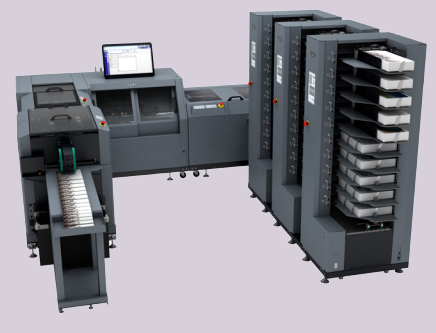
iSaddle 2 System