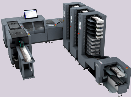
iSaddle 2 Duetto System