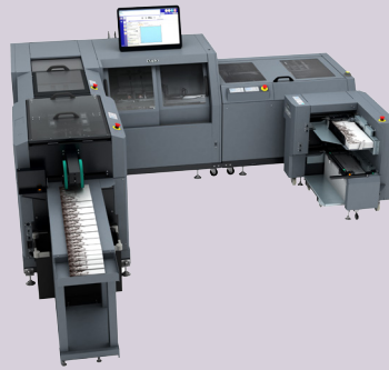
iSaddle 2 Digital System