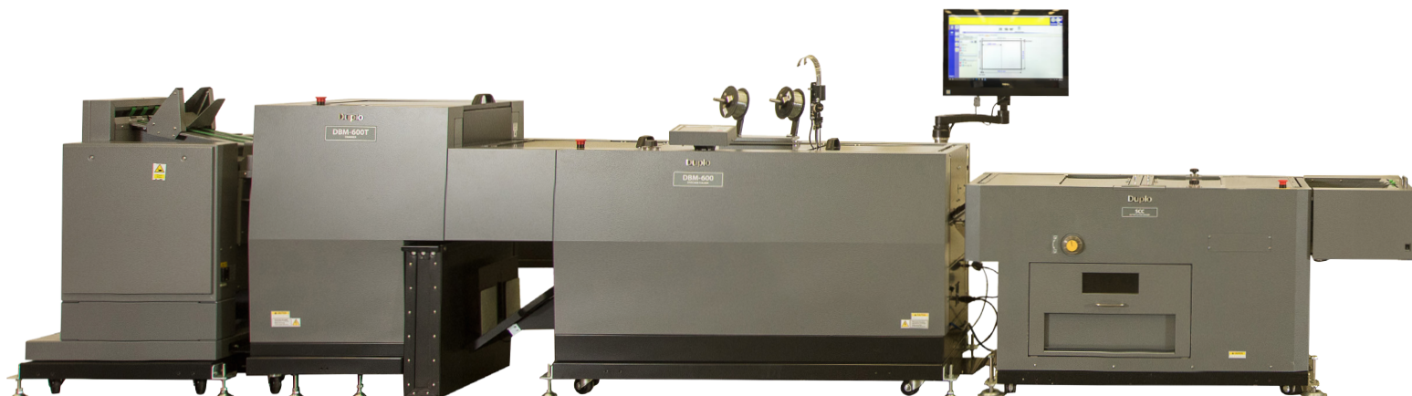
600R In-line Booklet System: ASM-600 + DBM-600T + DBM-600 Bookletmaker + Touchscreen PC + SCC Slit/ Cut/ Crease Module + DIB-R Bridge