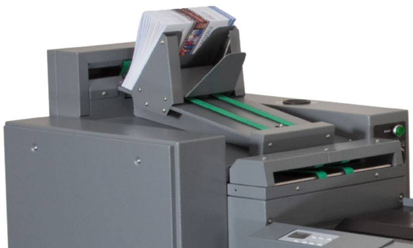
ASM-600 Square Spine